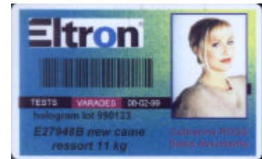
Yellow, Magenta and Cyan

The term Dye Sublimation is also referred to as Dye Diffusion. When the Dye on the ribbon is heated by the print head it is transformed from a solid to a gas and diffused onto the plastic card (the card is specially coated to absorb the color dye). The hotter the elements in the print head, the more dye is converted to a gas and absorbed into the plastic card. At 300dpi the picture quality and continuous color tones produced by a dye sublimation printer outperform most laser or ink jet printers with higher resolutions.