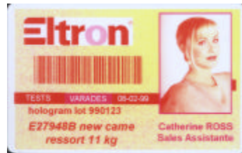
Yellow and Magenta