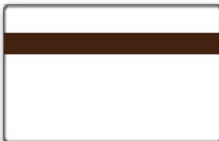
Magnetic Stripe Plastic Card

Magnetic stripe cards have been in existence since the early 70's when they were used on paper and film-based ID cards as well as credit cards. Magnetic stripe technology is widely used throughout the world and remains the dominant technology in the United States for transaction processing and access control. Other technologies such as PDF bar codes and smart chip cards are now capturing part of the magnetic stripe market since they can hold more information.